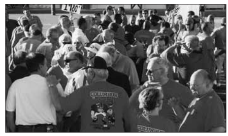
Alumni gathered on the field at halftime of the 100th football game between CHS and JVHS in 2008.

fully deductible for federal income tax purposes. With permission from the CHS principal, an Alumni Room was created and furnished at the school. The association then established a permanent endowment called Endowment for Excellence, to govern the distribution and use of funds for CHS programs, and began an effort to fund the endowment. The association also entered into a