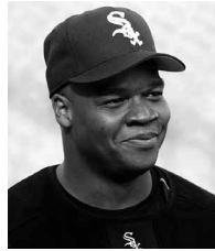
Frank Thomas '86